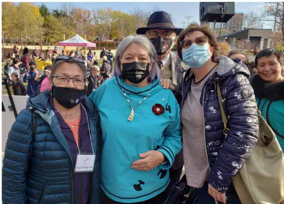
From the Parish Scrapbook

* Narcan is a prescription medicine designed to reverse the effects of an opioid overdose.