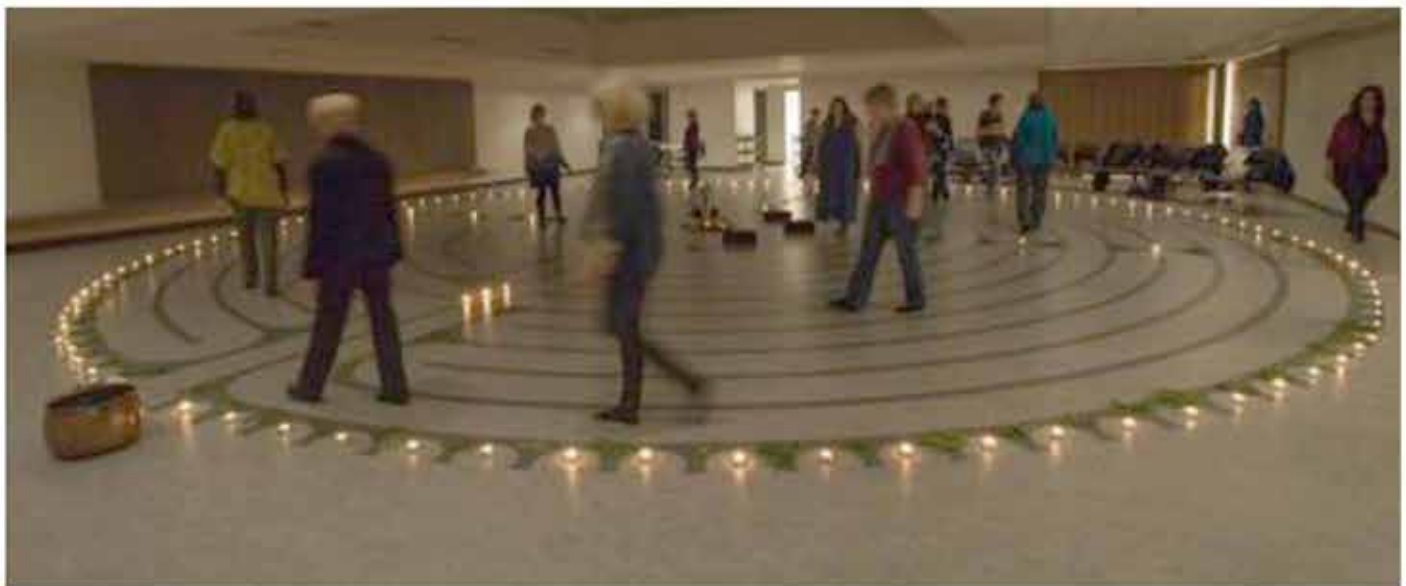
Labyrinths are traditional aids to prayer. This one is in the hall at Christ Church Cathedral on Sparks St.